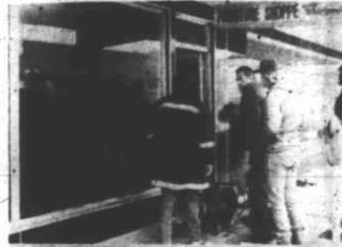
Eagle Lake volunteer firemen are shown in the photo above using one of the department's smoke ejectors to remove the dense smoke caused by a fire in the Furniture Shoppe in downtown Eagle Lake last Sunday afternoon. In the lower part of the photo, firefighters may be seen valiantly through the dense smoke in the process of extinguishing the fire caused by a faulty light fixture. Smoke damage to the contents of the store is expected to be extensive.